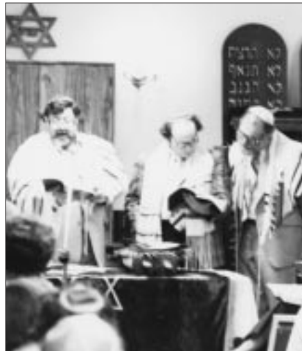
"Hebrew-Christians" ("Messianic Jews") conduct a "Shabbat" service at a "Messianic Synagogue". An authentic Torah scroll rests on the bimah.

So-called "Hebrew Christians" argue that a person who is born Jewish can never lose his birthright or heritage. However, the Bible teaches that your beliefs do influence your Jewish status and that a person who was born a Jew can at some point temporarily cease to be called a Jew.