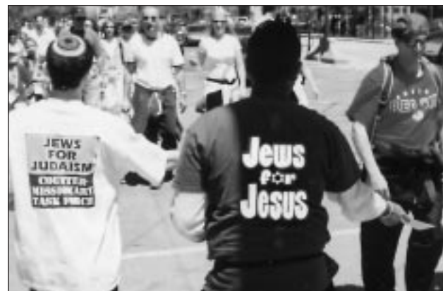
A Jews for Judaism volunteer counter-leaflets a Jews for Jesus missionary.

Jews for Judaism achieves these goals through counselling “Hebrew Christians”, monitoring missionary activity and offering a speakers’ bureau and intensive counter-missionary courses. Jews for Judaism is also a pioneer in the use of multi-