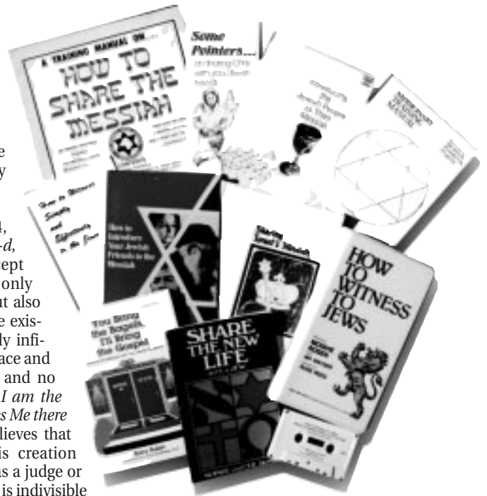
"How-to" manuals for the conversion of Jews have proliferated in recent years.

One thing upon which the entire Jewish community and several Christian denominations agree is that "Hebrew Christian" movements are not a part of Judaism. To be a "Jew for Jesus" is as absurd as being a "Christian for Buddha" and as ridiculous as "kosher pork"; it is an obvious contradiction. To paraphrase Elijah, if you are